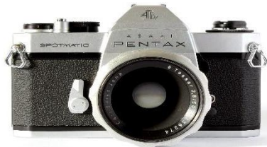
Photo Directory. Photos can also be submitted to the office for scanning. In addition, Sunday after service on September 24th and October 1st, a member will be able to take your photo if needed. Please have all photos submitted by October 2nd.

It has been a decade since we had a new church directory. This time we will be making it ourselves using personal photos. Please submit updated photos to our email: Attention